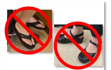
No shoes with open toes or open heels.

Avoid porous shoes, thin or tight leg coverings, and cuffed or rolled-up pants if there is a significant spill hazard.