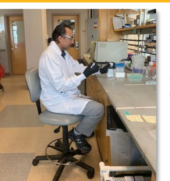
Contact your DLC EHS Coordinator with questions and for DLC-specific requirements.

For more information, search for PPE at <u>https://ehs.mit.edu/</u>.