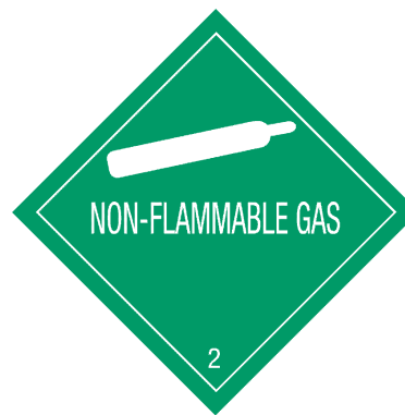
Figure 3: Nonflammable Gas Shipping Label

Customers must be aware of the importance of correct valve positioning on liquid helium containers. Loss of product or potentially hazardous conditions may result from improper valve configuration.